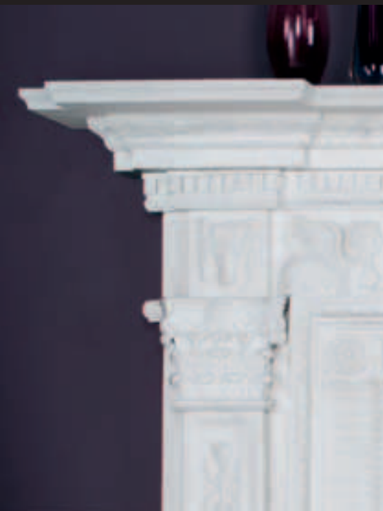
Library chimneypiece in Imperial white marble, shown with Library polished-steel hob grate and Italian slate hearth

A grand, historic chimneypiece, painstakingly hand-carved in Imperial white marble, makes any home stately. This well-proportioned design is based on the chimneypiece in the famously magnificent library at Kenwood House, which was created in the late 1760s. Bearing all the hallmarks of Robert Adam's love affair with classicism, it includes some of his signature decorations: sphinxes on the frieze, decorative pilasters topped by Corinthian capitals on the jambs, and bucrania (ox heads) on the frieze blocks. The source of inspiration for our distinctive Library hob grate was the early-18th-century model which partners the original chimneypiece. All our grates and fire baskets are suitable for solid-fuel, gas coal-effect, bio-ethanol and electric fires, so the choice is yours.