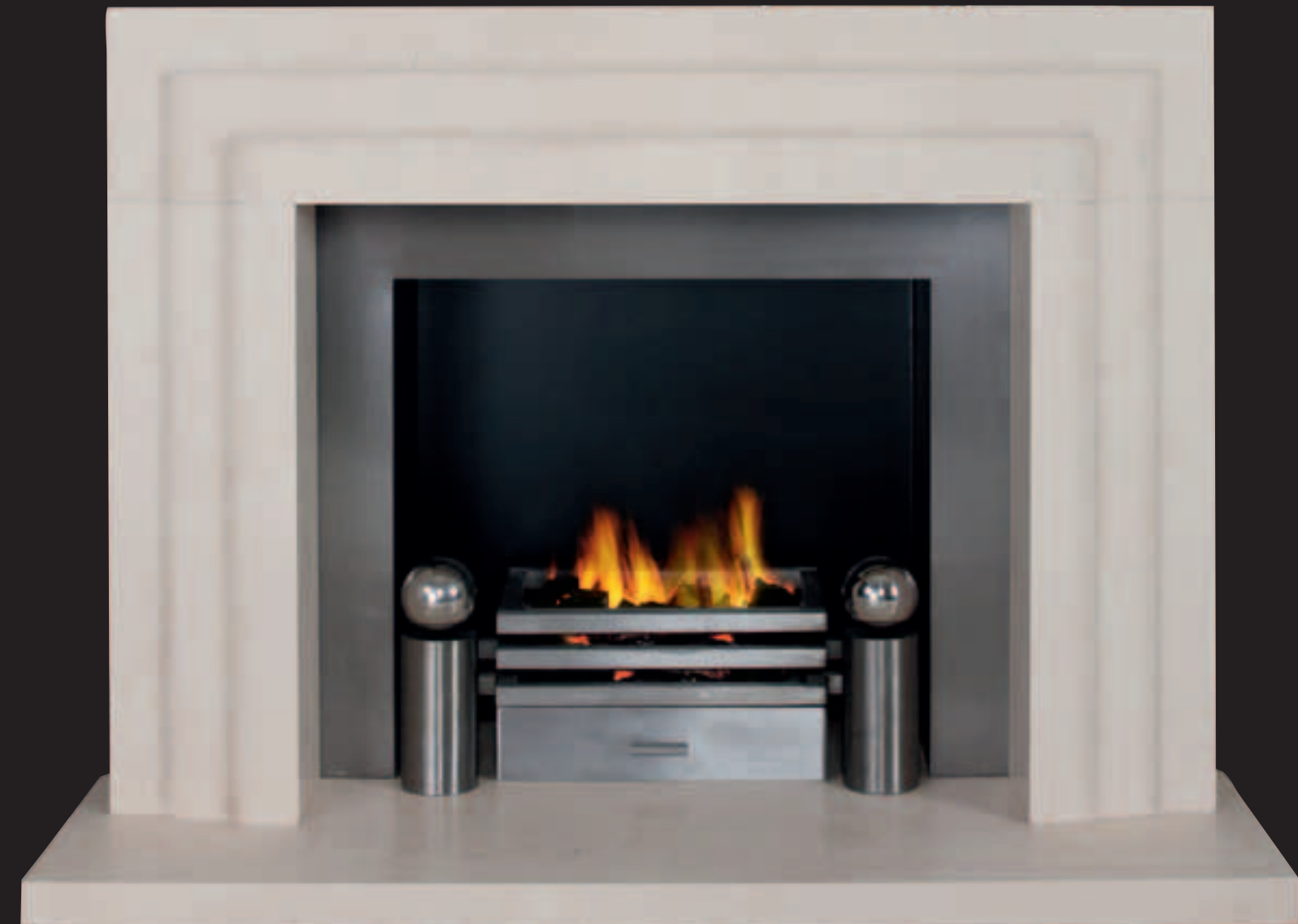
Boudoir chimneypiece in limestone, shown with Two Ball Modern fire basket, Modern steel slips and boxed limestone hearth

Whatever your taste in design, a period chimneypiece will create an architectural and social focus in the heart of your home. This fireplace surround, crafted with reference to a 1930s original in the Boudoir at Eltham Palace, is an iconic example of Art Deco styling and a contrast to the detailed marble chimneypieces in the collection. Beautifully understated, it showcases the soft tone and tactile finish of top-quality limestone. We have matched it below with our Two Ball Modern fire basket, a design with an equally solid and contemporary feel.