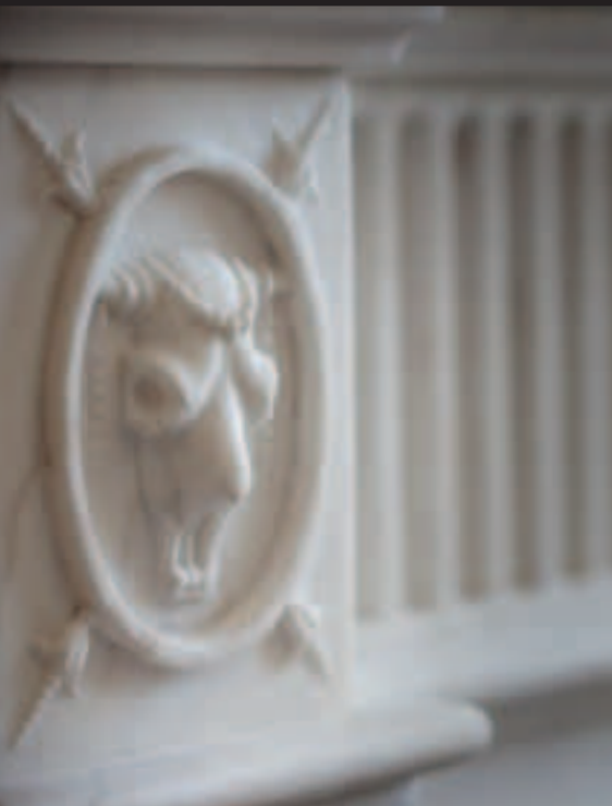
Entrance Hall chimneypiece in Imperial white marble, shown with Regency steel dog grate, Adam panels and Italian slate slips and hearth

This modest, well-proportioned and dignified creation in Imperial white marble takes its inspiration from the chimneypiece in the Entrance Hall at Kenwood House. Dating from the mid-18th century, the original was hand-carved by George Burns to a design by the Adam brothers and illustrates the discipline, skill and versatility required of a master carver. The Bacchus on the centre block is an allusion to the hall's one-time occasional role as a formal dining room; he is flanked by a fluted frieze, and bucrania (ox heads) on the frieze blocks. We show the chimneypiece with our Regency steel dog grate and a set of beautifully detailed Adam cast-iron panels, named after the most famous of Kenwood's architects. The chimneypiece interiors pictured in this brochure are simply suggestions: our extensive range of inserts, fire baskets, hob grates and panels provides a wealth of other possibilities.